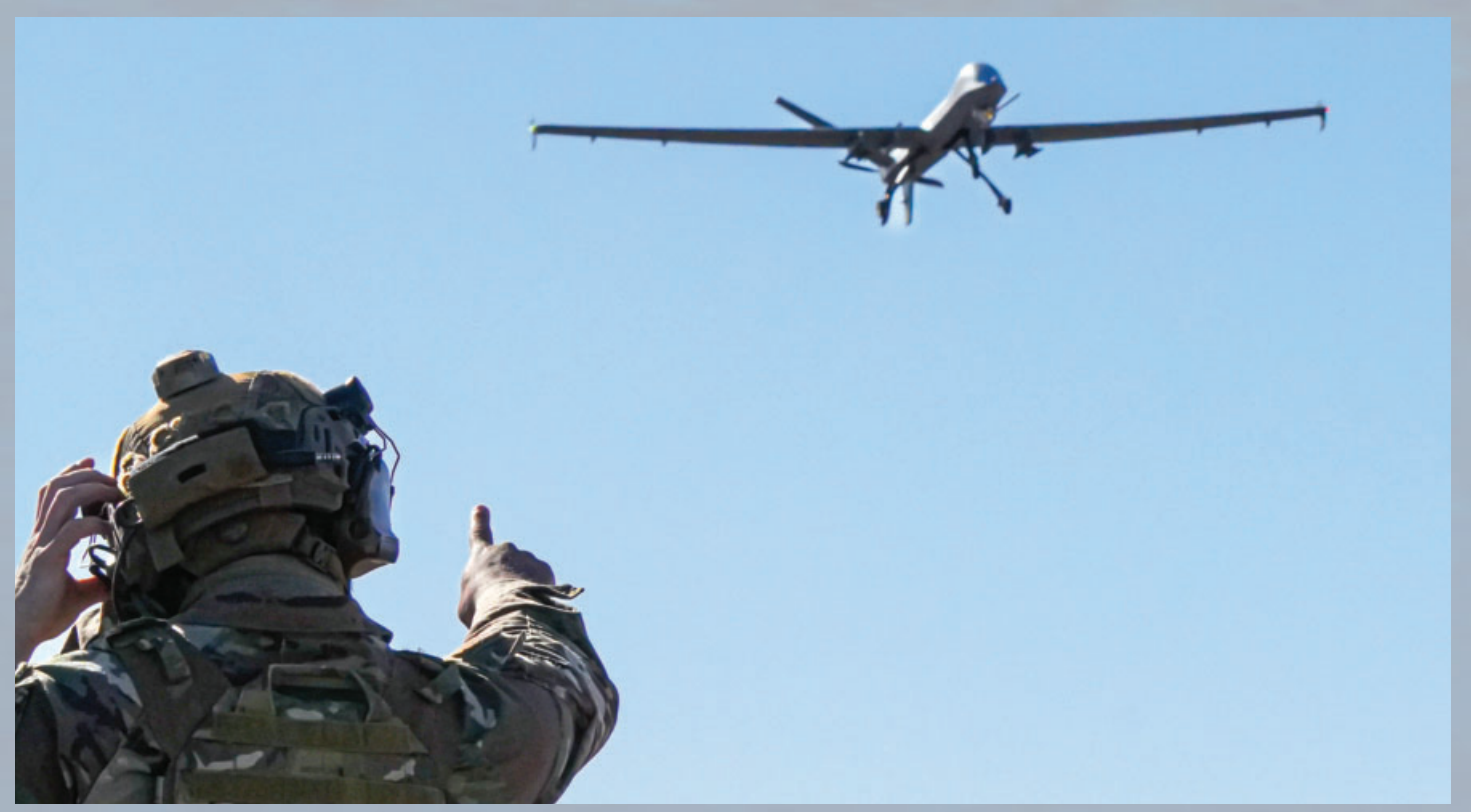
A U.S. Air Force Airman assigned to the 1st Special Operations Support Squadron Mission Sustainment Team watches as an MQ-9 Reaper prepares to land on an unprepared dirt surface at Melrose Air Force Range, New Mexico, Dec. 16, 2024.

"We have to break out of the mindset that we need a huge, paved runway with co-located launch and recovery aircrews," the mission commander added. "If we can free ourselves from the traditional mindset, it makes MQ-9 combat reach nearly limitless."