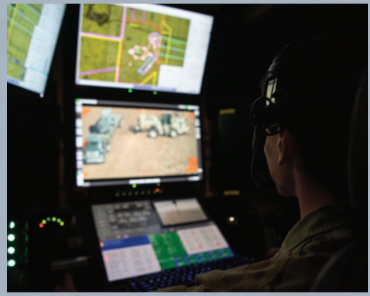
A U.S. Air Force MQ-9 Reaper sensor operator participates in Exercise Reaper Castillo at Hurlburt Field, Florida, Dec. 16, 2024. The exercise aimed to sharpen the squadron's mission-essential tasks while pathfinding new MQ-9 combat capabilities such as landing on a dirt strip, refueling, rearming and relaunching in austere locations.

"If special operations MSTs can enable mission generation at the forward edge of the battlefield, it can