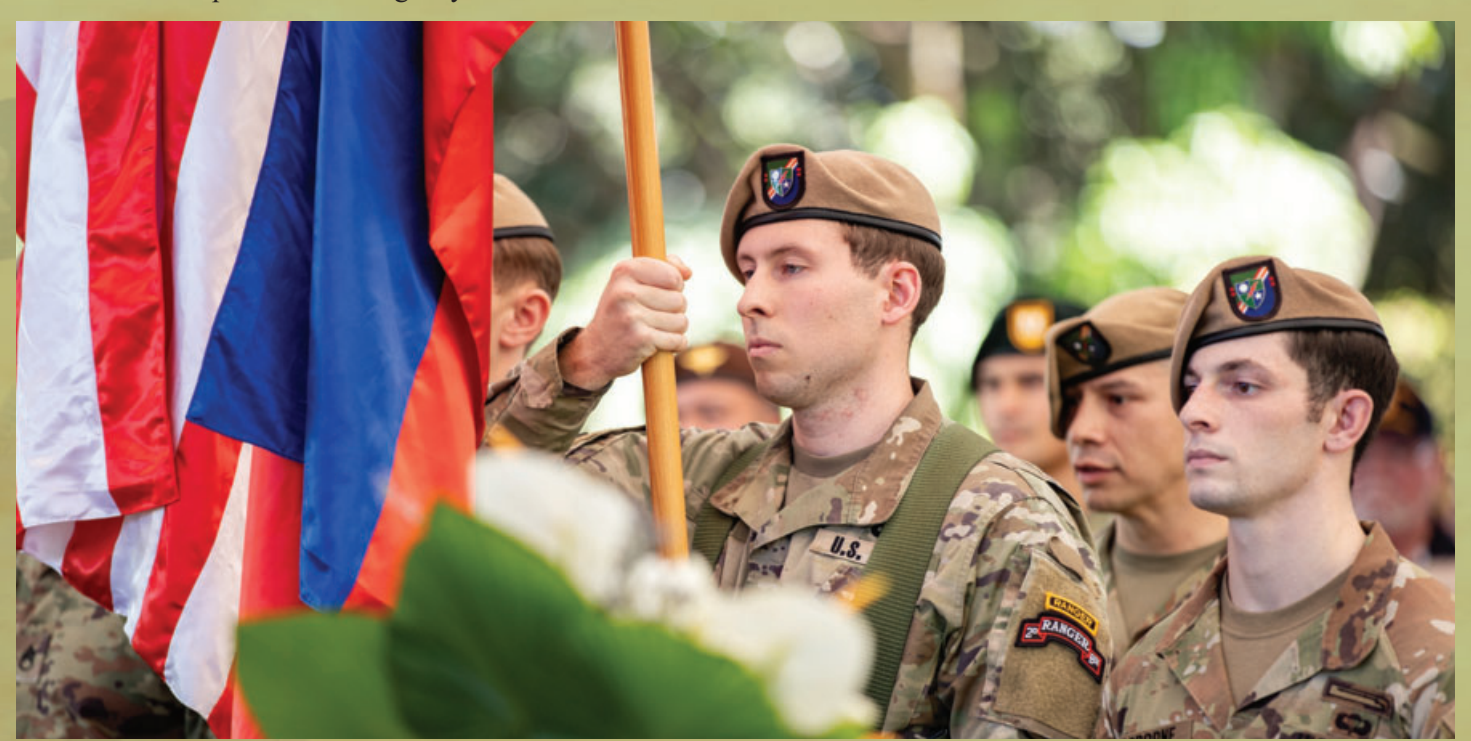
U.S. Army Rangers assigned to 2nd Battalion, 75th Ranger Regiment present the colors during the commemoration of the 80th Anniversary of the Raid and Liberation of Cabanatuan Prisoner of War Camp at the City of Cabanatuan, Philippines, Feb. 1, 2025.

So it came to pass that on 30 Jan 1945, the sun set on the Cabanatuan Prison Camp, with more than 500 POWs wondering if that night was the night they'd be massacred like in Palawan.