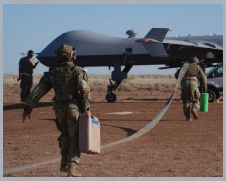
U.S. Air Force Airmen assigned to the 1st Special Operations Support Squadron Mission Sustainment Team refuel an MQ-9 Reaper assigned to the 1st Special Operations Wing at Melrose Air Force Range, New Mexico, Dec. 16, 2024.

As the future of Air Force operations adapt to emerging technologies and evolving threats, the forward-thinking approach of these teams is crucial to unlocking the full potential of the MQ-9.