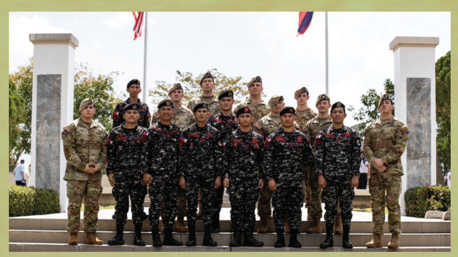
U.S. Army Rangers assigned to 2nd Battalion, 75th Ranger Regiment and Philippine Army Soldiers from the First Scout Ranger Regiment, pose for a group photo during the commemoration of the 80th Anniversary of the Raid and Liberation of Cabanatuan Prisoner of War Camp at the City of Cabanatuan, Philippines, Feb. 1, 2025.

"The Ranger Creed wasn't written until nearly thirty years after the Great Raid, but it's clear to me that it was inspired by the actions of these Rangers, Alamo Scouts, Guerrillas, and pilots", said Bryan. "Giving 100 percent and then some, energetically meeting the enemies of their country, never leaving a fallen comrade, displaying the intestinal fortitude required ... it all started in places like Cabanatuan. What they did there shaped not just the words in our Creed, but the expectations of who we are today and what we must continue to be every day."