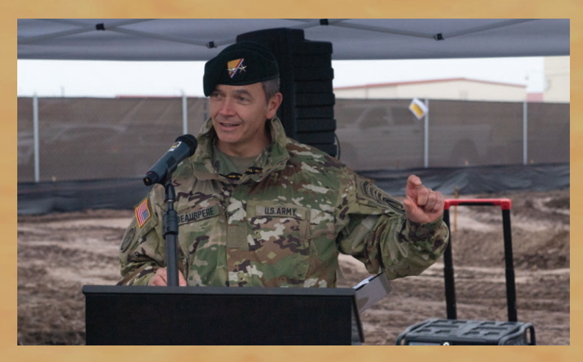
U.S. Army Maj. Gen. Guillaume N. Beaurpere, USSOCOM chief of staff, gives remarks during the groundbreaking ceremony for the Special Operations Forces Integration Facility on MacDill Air Force Base, Fla., Jan. 23, 2025.

The facility is scheduled to be completed in 2027, and its unique features will serve as the node for SOF operations for a new task force conducting missions all over the globe that will better posture and enable special operations forces to accomplish whatever mission they are assigned.