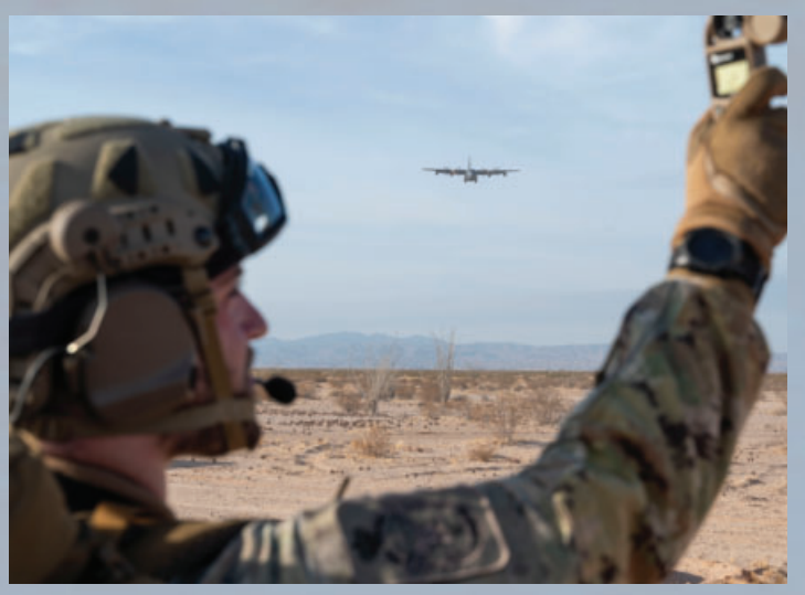
An Italian special operation forces member uses a kestrel to detect the weather while a U.S. Air Force Special Operations Command MC-130J Commando II flys over during Emerald Warrior 25.1 in Arizona, Jan. 31, 2025.