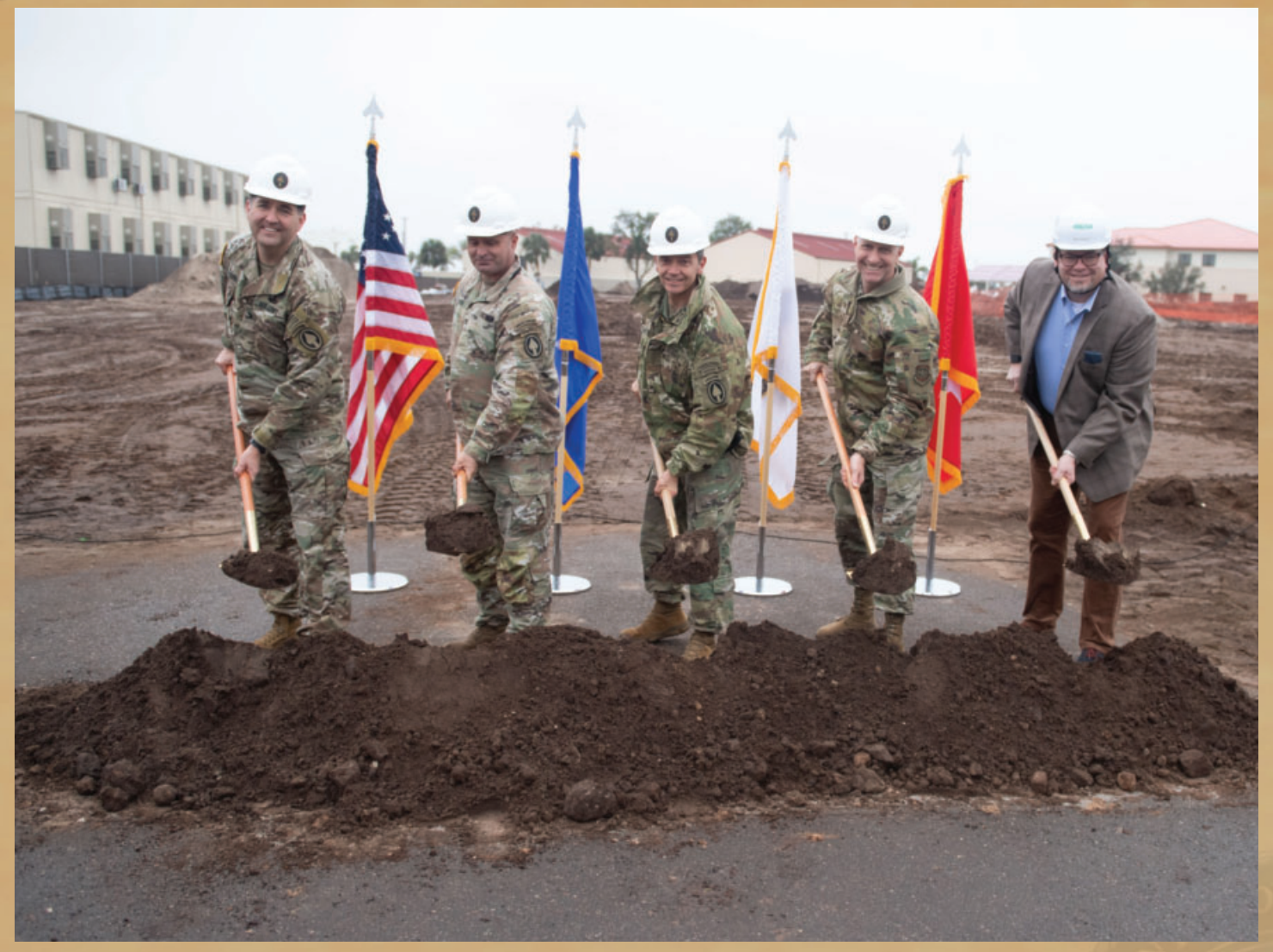
Leaders from USSOCOM and MacDill Air Force Base participate in the groundbreaking ceremony for the Special Operations Forces Integration Facility on MacDill Air Force Base, Fla., Jan. 23, 2025. The SOF operations integrations facility consists of a two-story building totaling 57,000 square feet in size and will take two years to build.